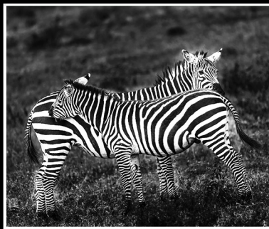
IR Level 2