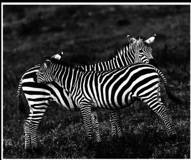
IR Level 1

The infrared brightness levels can be adjusted from 1 to 3.