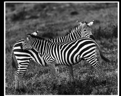
IR Level 3

The infrared beam can be focused (far) or scattered (near).